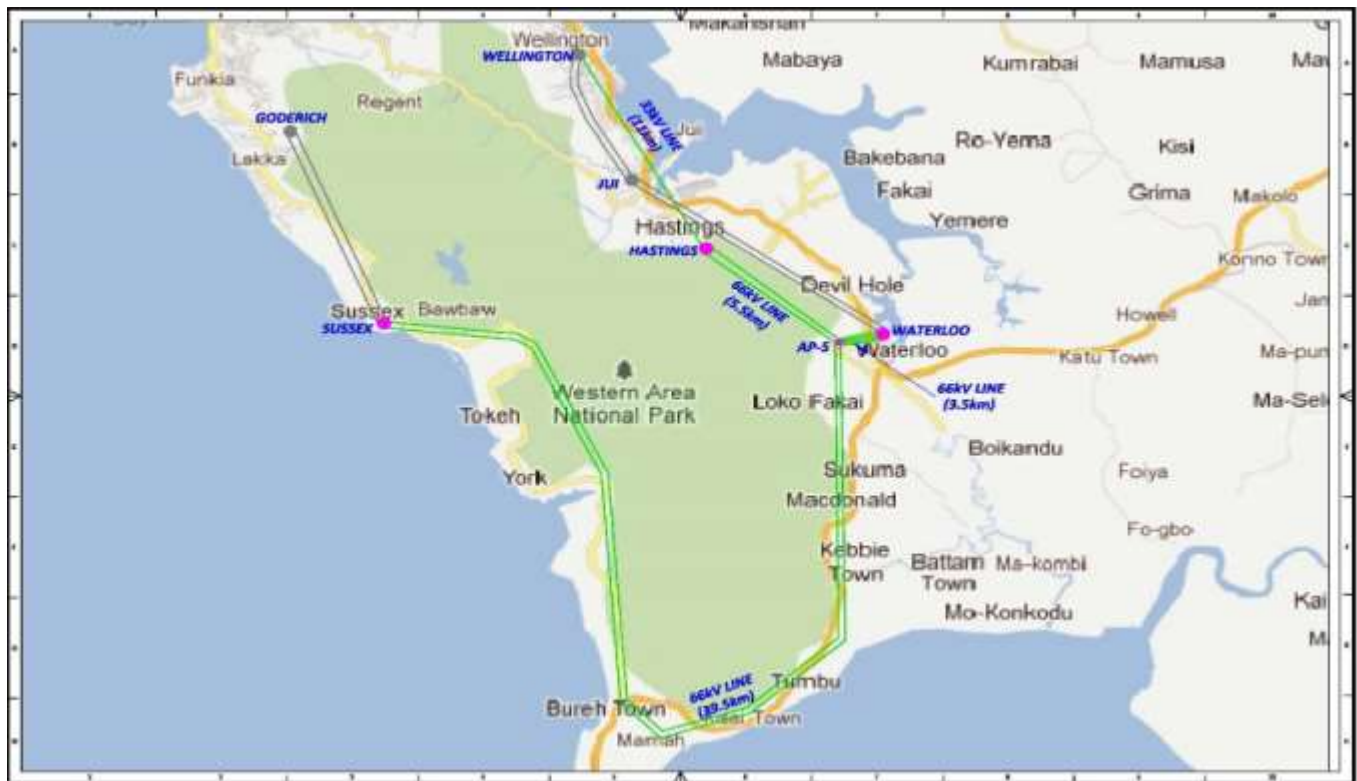
Indicative sketch for 66kV network in the country map