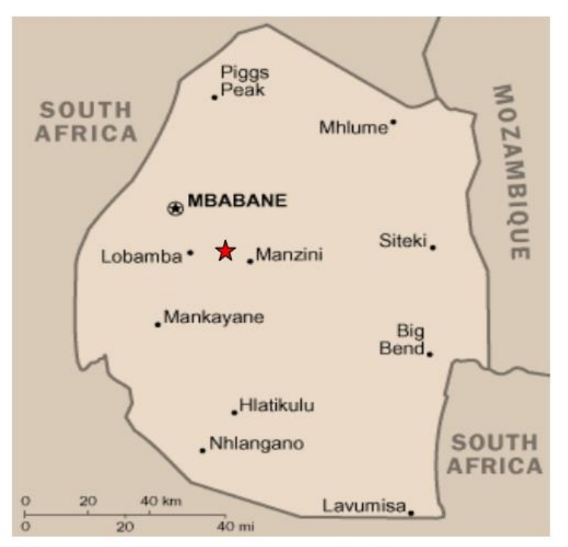
Figure 1 : Map showing proposed site location at regional context

& MR103 road on front side (South side). Site has grand view of Hhohho region mountains on North-East side and Mountains of Manzini region on South-West side.